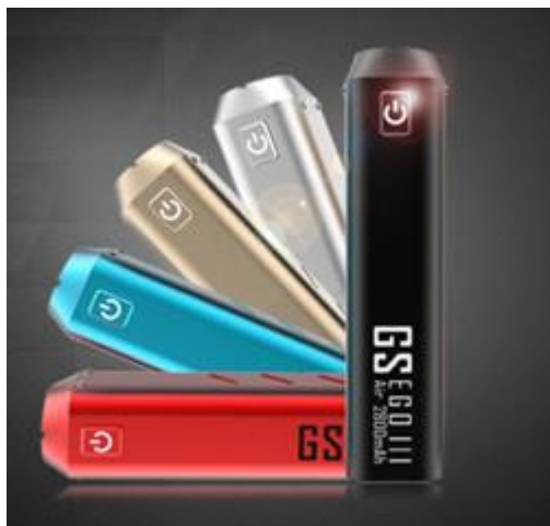
LCD for e-cigs