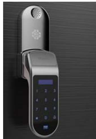
Lcd for door lock